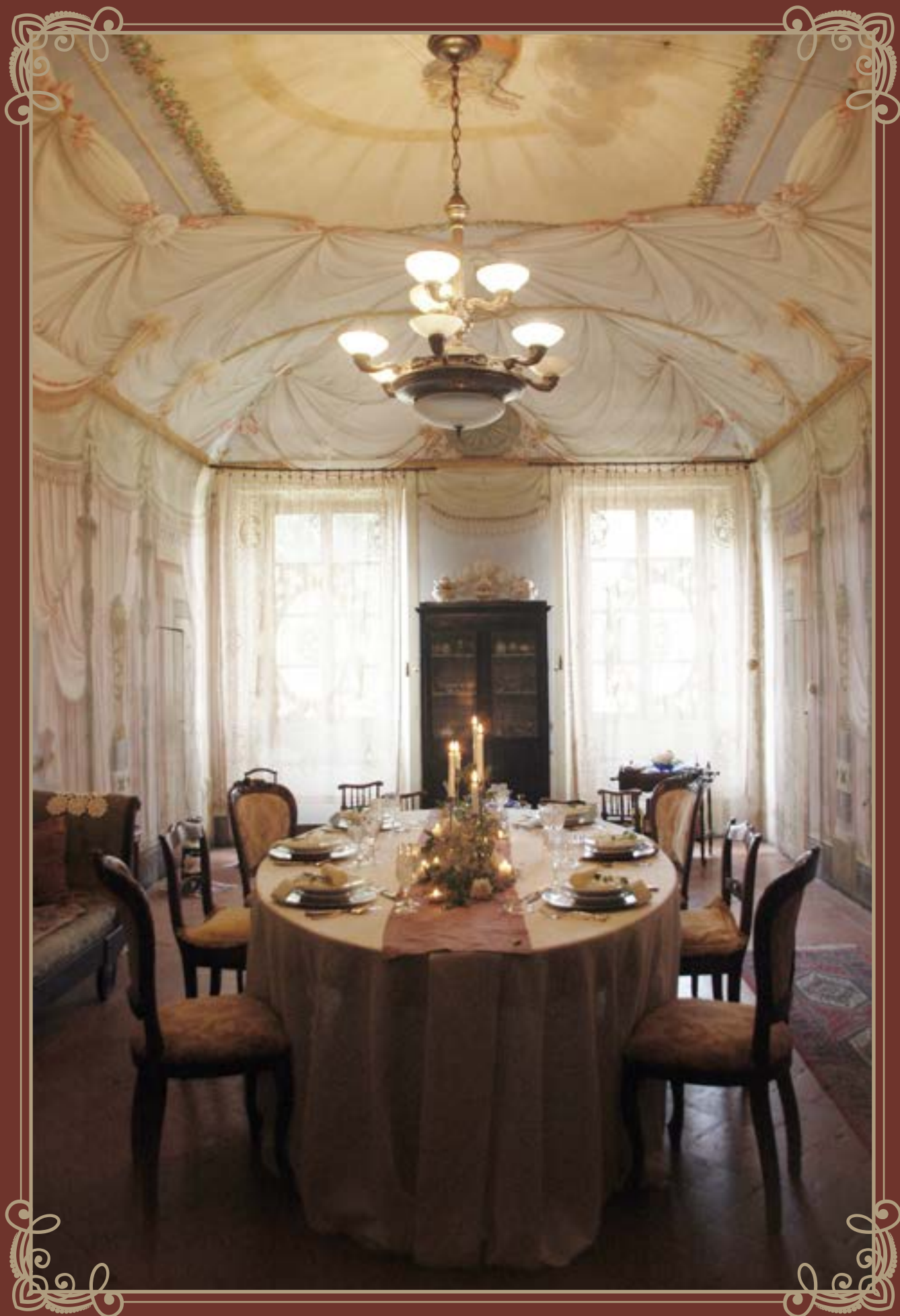
Dining Room for up to 8 guests